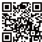
DSEDJ account on WeChat ID:dsedjmacau